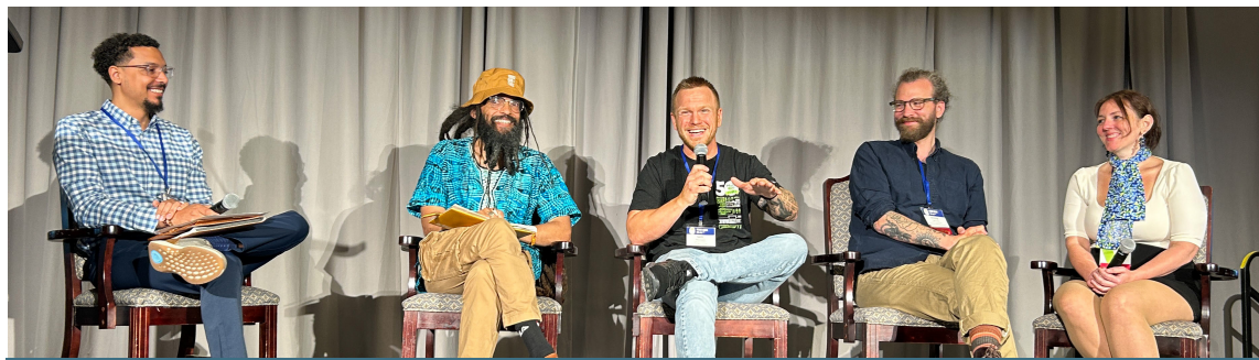
At CCMA 2024, co-op leaders from National Co-op Grocers, Gem City Market, The Merc, Syracuse Co-op, and Erie Food Co-op shared stories of organizing in low-income, low-access neighborhoods.

UWCC develops regional workshops, national conferences, and tailored education for cooperative leaders.