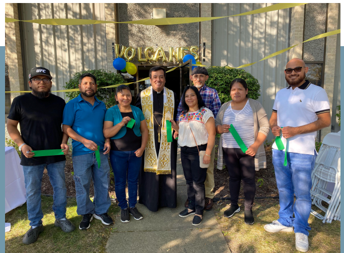
Worker-owners of Los Volcanes each holding a portion of the ribbon from their cooperative launch.

percent of UWCC clients report high satisfaction on UWCC's annual client survey