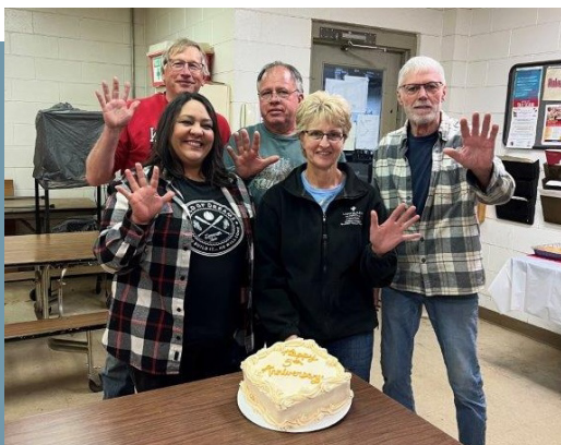
Snow River member-owners celebrate their 5th anniversary.