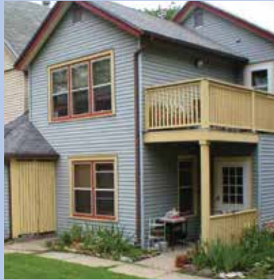
Ridge Side Co-operative.

Homestead Cooperative of Mt. Horeb provides 25 homes to active senior citizens.