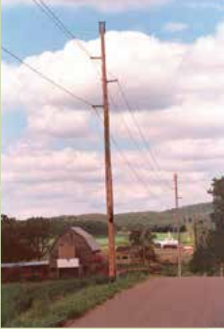
Adams-Columbia Electric Cooperative