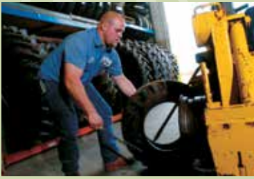
Tire change at Landmark Cooperative

A co-op's employees , as in other businesses, are hired to carry out the tasks needed to operate the cooperative. Employees significantly contribute to members' overall satisfaction with their co-op as they interact with members in co-op transactions. Employee understanding of cooperative principles and objectives can be an important part of positive member relations. In the case of worker-owned cooperatives, the management and employees may both be member-owners.