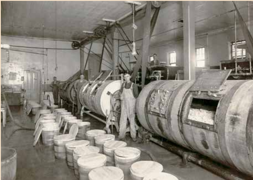
Barron Co-op Creamery, ca. 1900.