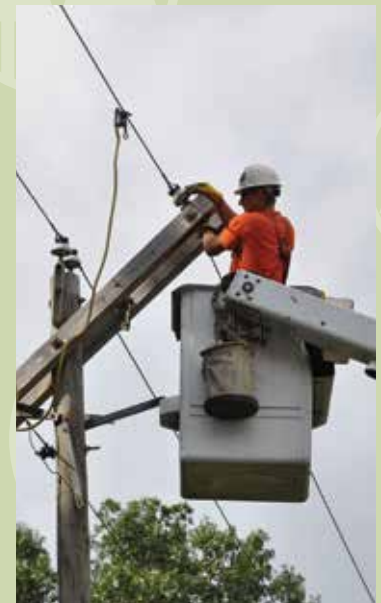
Adams-Columbia Electric Cooperative worker fixes utility lines.

New agricultural co-ops have been created to market "value-added" products. Members' products are produced, processed, or packaged in ways that command higher prices, providing greater returns to the co-op's members. Ethanol from corn and milk produced in accordance with organic standards are both examples of value-added products made by Wisconsin cooperatives.