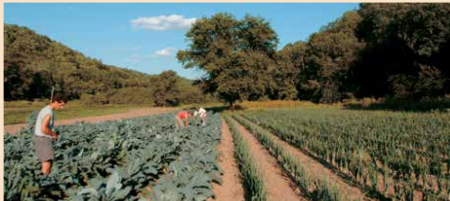
Organic Valley/CROPP Cooperative ©2006