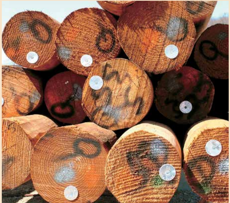
Utility poles.