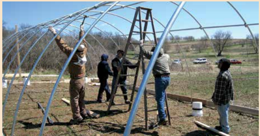
Members of the Spring Rose Growers Co-op build a hoop house to extend the season.