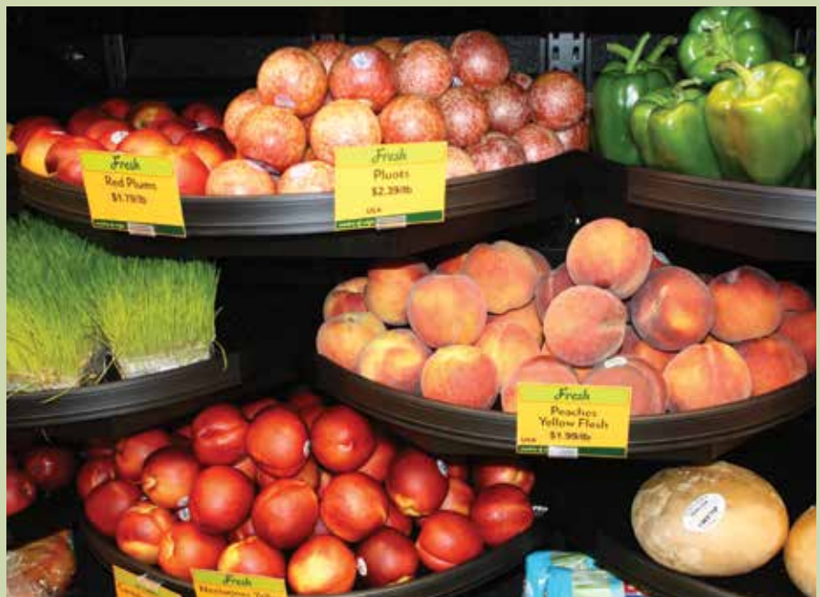
Organic produce at People's Food Co-op in LaCrosse, WI.

USDA has an online library of publications about cooperatives, cooperative development, and issues related to ongoing cooperative operations. www.rurdev.usda.gov/BCP_Coop_LibraryOfPubs.htm