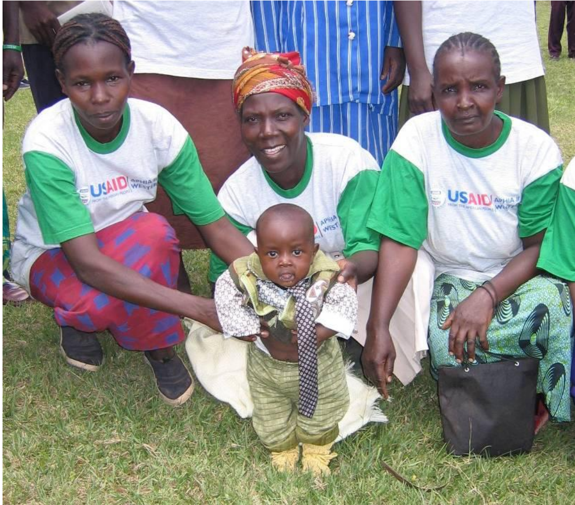
Community health workers and friend, Western Province

Following is an excerpt from “Synopsis of Community Health Mobilization Research in the Western Province of Kenya,” that the author wrote in 2008. It presents a summary of the research findings from a set of focus groups conducted with village residents and community health workers.