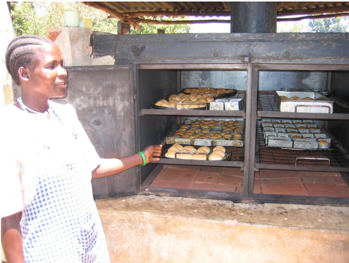
Bakery run by village women's group, Western Province