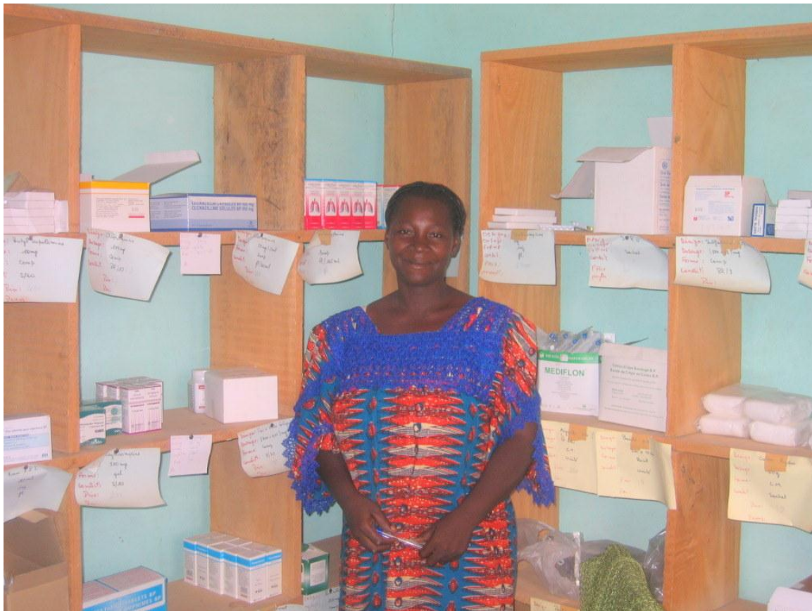
Community-run pharmacy in Burkina Faso

Now there is interest in revitalizing the co-op. One possible product is coconut oil for use as a biodiesel fuel. Since the new diesel generator is located virtually in the center of this major coconut growing area, the old co-op and the emerging health co-ops could get together to explore joint production and marketing to the diesel plant and to other coconut oil buyers. Not only that, the old co-op building is still in good shape and is well-located to be the site of the proposed joint village pharmacy.