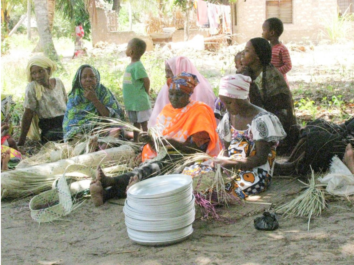
Women's group members weave and sell mats, Coast Province