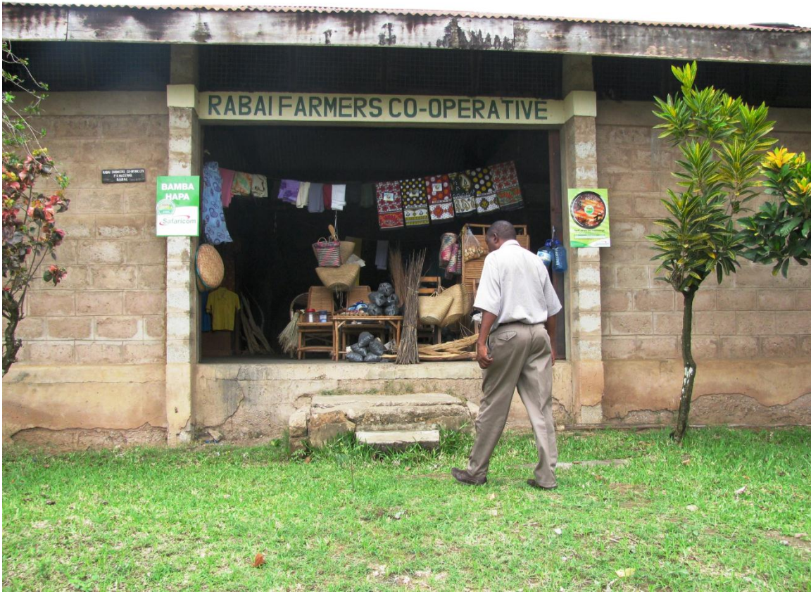
Exploring the potential for linking a dormant farmers co-op with 2 village health co-ops, Coast Province